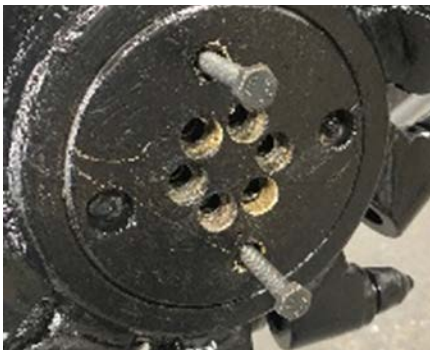
Figure 3, pusher bolts