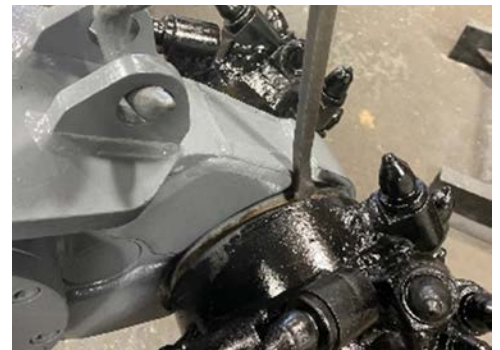
Figure 5, pry drums off