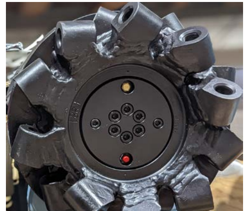
Figure 2, G5 drum end cap showing bolts