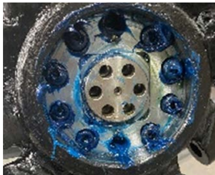
Figure 4, drum bolts